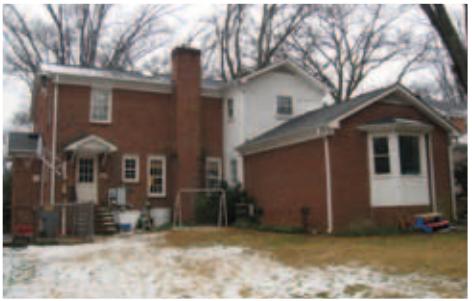
View from rear of home prior to renovation