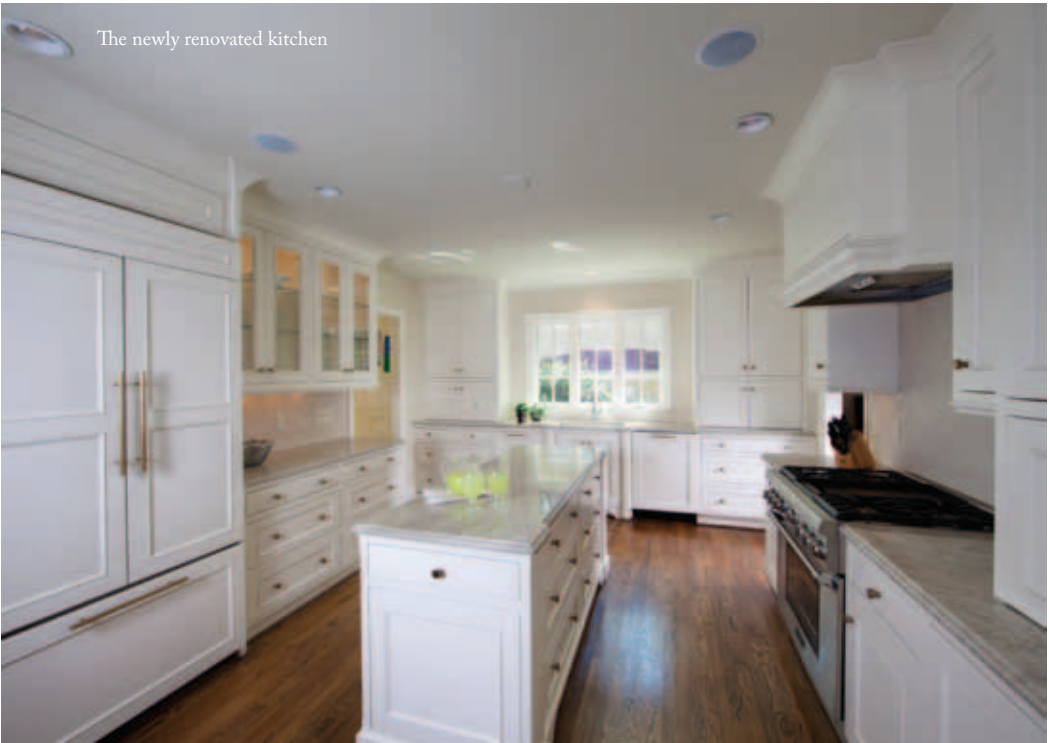
The newly renovated kitchen

A new master suite was created on the main level of the home, maintaining privacy, yet offering easy access to the home's core and great views of the backyard and added covered veranda. A trey ceiling was added to give elegance and spaciousness. The suite has double walk-in closets, and new bath, with stack-able washer dryer. The warmth of the hardwoods continues into the bath. The tub