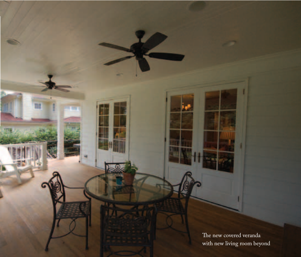
The new covered veranda with new living room beyond

Almost every home on the street can tell wonderful stories about days of old.