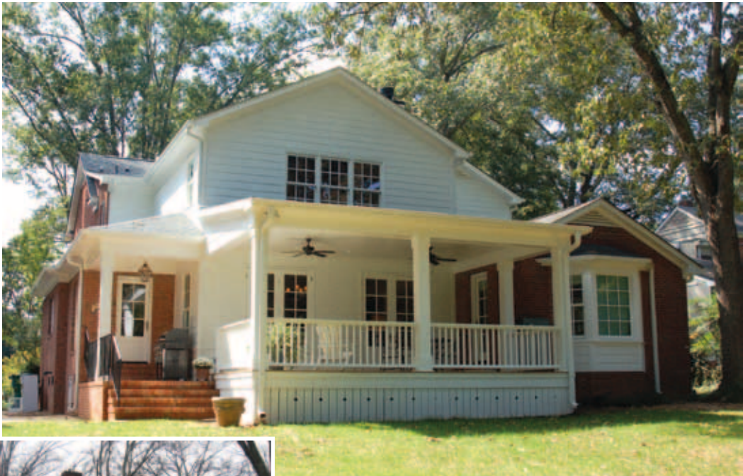
View of new addition from Rear of home